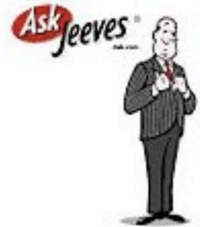
Ask Jeeves in 2004