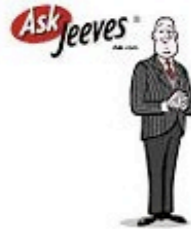
Ask Jeeves in 2001