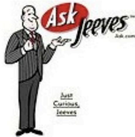
Ask Jeeves in 2000