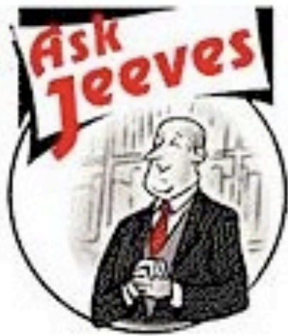
Ask Jeeves in 1996